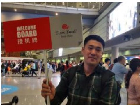
Welcome to Beijing.

I gave a short presentation on the work we are doing in South Africa to promote ethical farming and food production.