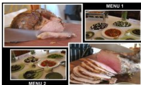
Table 1 and Table 2. Identically cooked dishes using organic vs industrial meat and vegetables. We had to guess which was which.