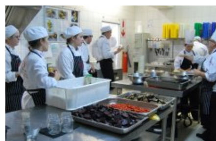
Hectic activity and strict guidelines for the student chefs.