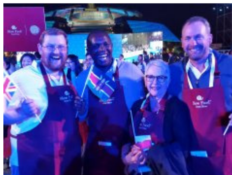
The English-speaking contingent. Wales (pig farmer), Kenya (10,000 gardens project), me and Canada (fishing).