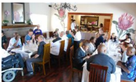
Some of the 80 attendees taste and discuss the dishes.