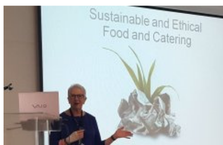
Presentations in the beautiful, state of the art auditorium at Prue Leith Chefs Academy.

Here's the link to an article in Business Day - Food takes on an ethical flavour