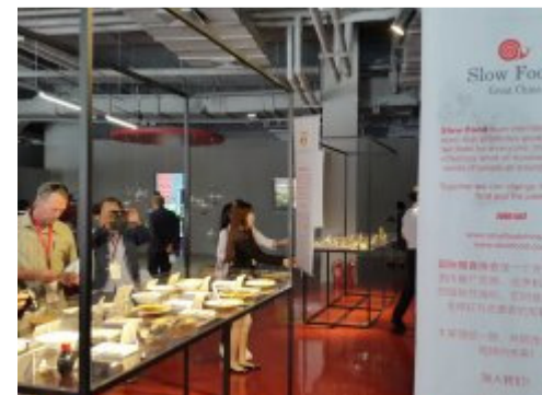
Arc of Taste displays - seeds, plants, farm animals, cheeses, etc., which qualify to be protected and preserved, registered in Italy.