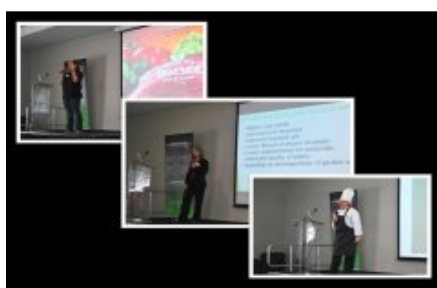
We had 8 speakers covering introduction to Slow Food, organic meat, fish farming, genetic engineering, Bokashi for waste, green kitchens, Fair Trade, climate change and more.